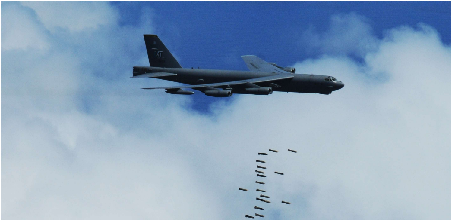
The Crusaders continue their war against Islam

reason we addressed it at the end of the above list. The fact is, even if you were to stop bombing us, imprisoning us, torturing us, vilifying us, and usurping our lands, we would continue to hate you because our primary reason for hating you will not cease to exist until you embrace Islam. Even if you were to pay jizyah and live under the authority of Islam in humiliation, we would continue to hate you. No doubt, we would stop fighting you then as we would stop fighting any disbelievers who enter into a covenant with us, but we would not stop hating you.