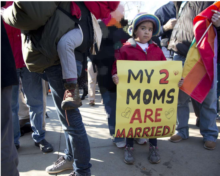
An example of the perversion the West seeks to spread

separate between religion and state, thereby granting supreme authority to your whims and desires via the legislators you vote into power. In doing so, you desire to rob Allah of His right to be obeyed and you wish to usurp that right for yourselves. “Legislation is not but for Allah” (Yusuf 40). Your secular liberalism has led you to tolerate and even support “gay rights,” to allow alcohol, drugs, fornication, gambling, and usury to become widespread, and to encourage the people to mock those who denounce these filthy sins and vices. As such, we wage war against you to stop you from spreading your disbelief and debauchery – your secularism and nationalism, your perverted liberal values, your Christianity and atheism – and all the depravity and corruption they entail. You’ve made it your mission to “liberate” Muslim societies; we’ve made it our mission to fight off your influence and protect mankind from your misguided concepts and your deviant way of life.