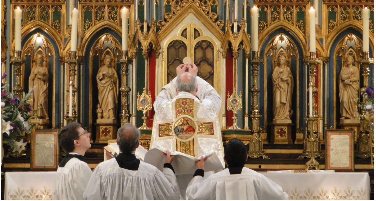
Christian disbelief and paganism

that the masses deem to be “politically incorrect.” The apostate “imams” in the West will adhere to the same tired cliché in order to avoid a backlash from the disbelieving societies in which they’ve chosen to reside. The point is, people know that it’s foolish, but they keep repeating it regardless because they’re afraid of the consequences of deviating from the script.